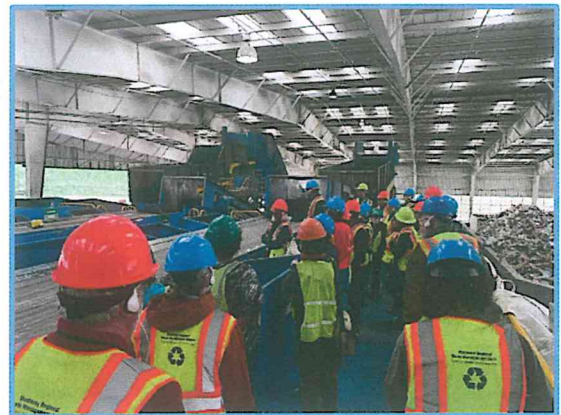
Attendees of the Recycling 101 workshop tour the MRF.

The new Recycling 101 workshop offers a concise history of recycling in the US including the recent turmoil in international markets and its impact on local recycling programs. The District MRF is described including the materials we are diverting, the end markets they are shipped to, and what they become. Attendees also receive a tour of the MRF and plenty of time for question and answers. The February 2 workshop was fully subscribed with 30 residents who turned out on a stormy Saturday morning to attend. Post workshop surveys provided a lot of positive feedback and suggestions that will be incorporated into future workshops.