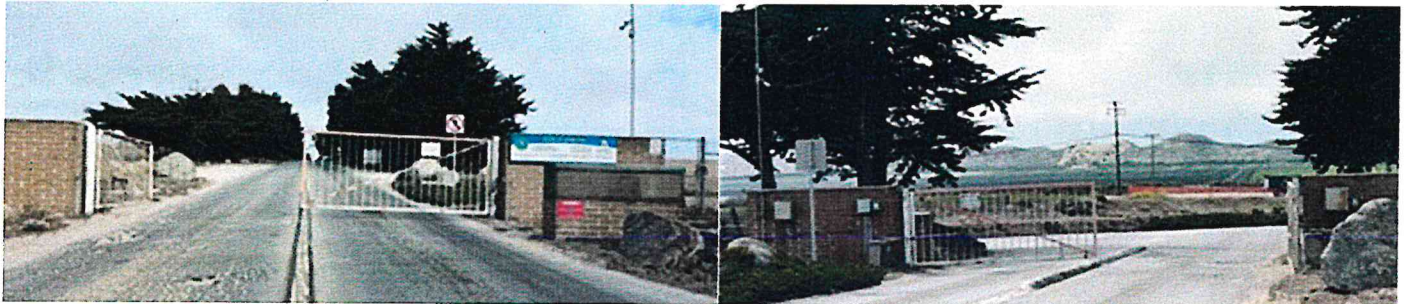
Current Conditions (2021)

The entrance to the Monterey Regional Waste Management District’s (MRWMD) recycling and disposal facilities is located on Charles Benson Road near its intersection with Del Monte Boulevard. The front entrance consists of two gates, an inbound and outbound gate, each with separate motorized drives and a controller. The gates are custom made due to their size and requirements for structural integrity. The most recent full replacement of the front gate system was in 2006. Since 2006, the motorized units and the control system have been replaced on a couple occasions as each are generally considered to have useful lives of 5 to 7 years. The control system was recently upgraded in 2019. The outbound gate was recently replaced with a non-custom gate after it had been struck and damaged. The pictures below present the current conditions of the front entrance gates.