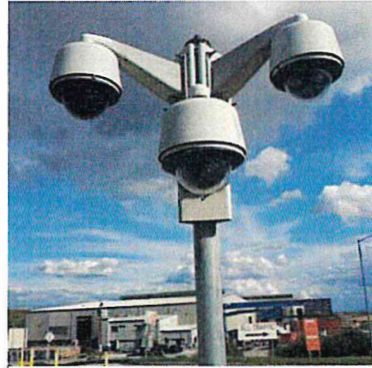
Existing Pelco PTZ License Plate Cameras