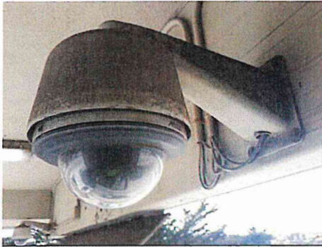
Existing Pelco PTZ Load Camera above Scale C