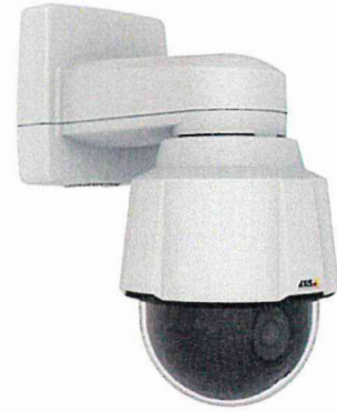
Proposed Axis P5655-E PTZ camera