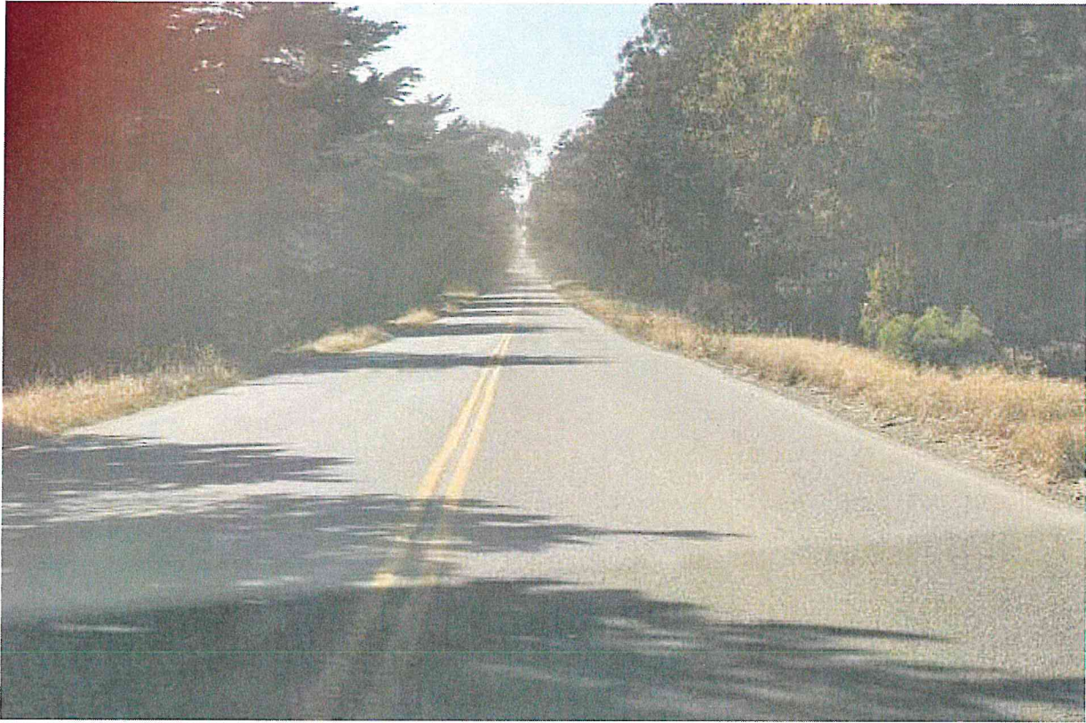
Photo 2 – View in northwest direction along Charles Benson Road (District's Entrance Road)