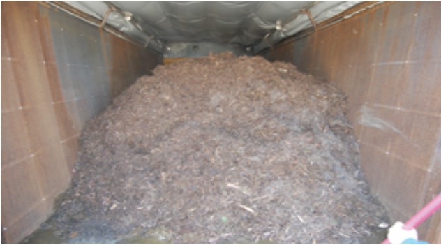
Foodwaste and greenwaste before composting

When I visited the facility in early March, the initial batch of percolate (cow manure as the seed vetch) was being brought up to operating temperature with the help of a gas-fired heater that was later discarded as the digesters achieved thermophilic operating conditions. The system is now fully operational, providing the providing power to the wastewater treatment plant. The most valuable return at the moment, from viewpoint of both ZWE and MRWMD is the wealth of operational experience and knowledge for use in the future.