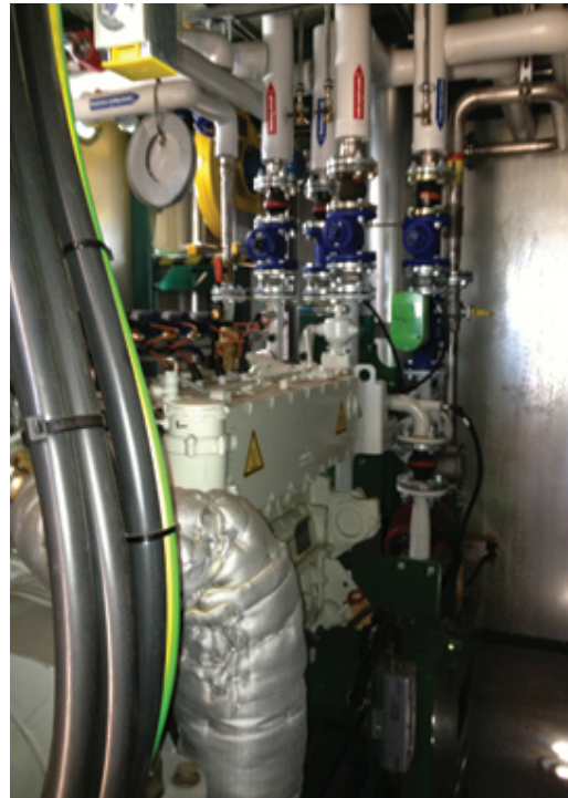
View of 2G Cenergy 100-kW cogen plant

When I visited the facility in early March, the initial batch of percolate (cow manure as the seed vetch) was being brought up to operating temperature with the help of a gas-fired heater that was later discarded as the digesters achieved thermophilic operating conditions. The system is now fully operational, providing the providing power to the wastewater treatment plant. The most valuable return at the moment, from viewpoint of both ZWE and MRWMD is the wealth of operational experience and knowledge for use in the future.