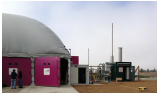
Then campus of the Monterey Regional Waste Management District is ready to cook with gas.

The agreement between MRWMD and ZWE, calls for the latter to install and operate the complete system as part of a five-year demonstration project in exchange for revenues from electrical power sale to the wastewater treatment plant located next door, and tipping fees associated with the food and source separated yard waste delivered to and processed by the SmartFerm unit.