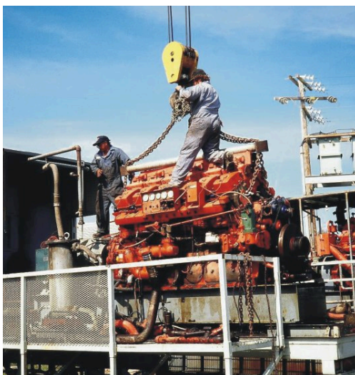
Twin trailer mounted generators were first installed in 1983.