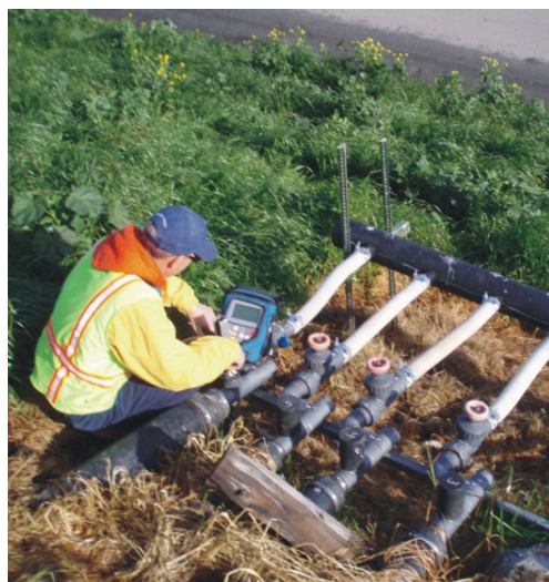
Staff measure landfill gas flow, composition and check for potential gas migration.