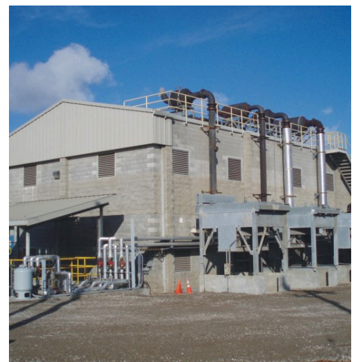
LFG building today showing waste heat recovery radiators.