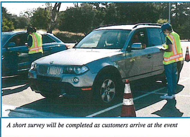
A short survey will be completed as customers arrive at the event

Outreach for the event is being conducted through direct mail flyers targeting the District's farthest southern and eastern service areas. Paid advertisements are appearing in the Monterey County Weekly, Monterey County Herald, Carmel Pine Cone, Cedar Street Times, and on several social media channels. District staff will survey attendees to determine participation by origin, how they were informed of the event, and their use of the District permanent HHW facility. A complete report on the event will be provided to the Board in July.