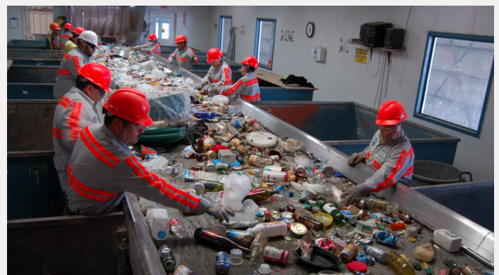
First sort line at the Materials Recovery Facility