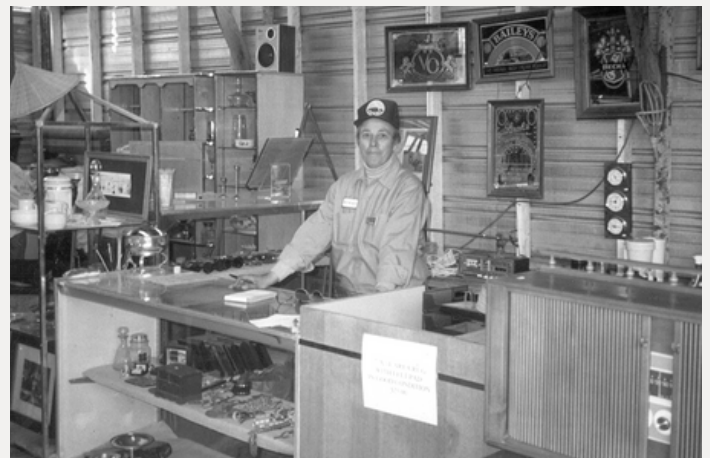
Early Last Chance Mercantile